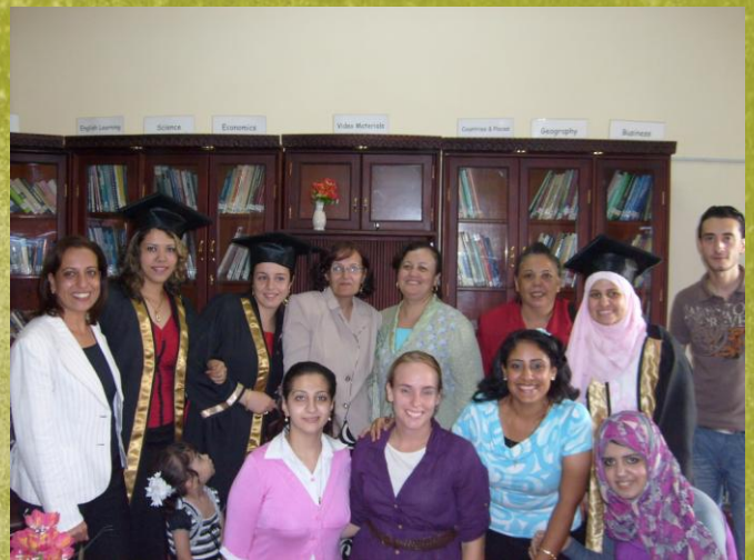
Staff and Friends of the Community Service Center.