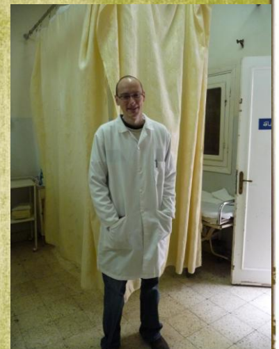
At the base of Mt. Sinai/ In the Emergency Room at Harper Memorial Hospital

We always love to hear from you. Please write us at: tepvvd@hotmail.com or c/o M.C.C. 24 El Eman Aly St. Midan El Ismailia Heliopolis, Cairo, Egypt