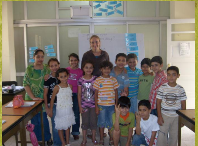
Children's Conversation Course

Once again, thank you so much for all your prayers and support. We feel so loved and blessed by having you in our lives.