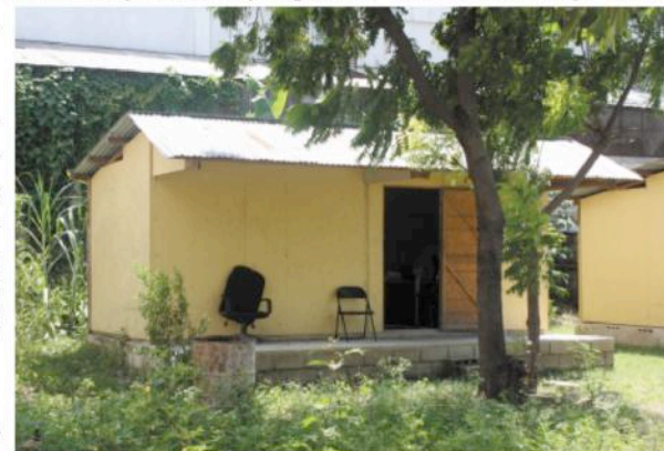
PWOFOOD's present office

If your church is interested in working with PWOFOOD in this phase of reconstruction, please contact the Service Link office in Grand Rapids, MI or Burlington, ON.