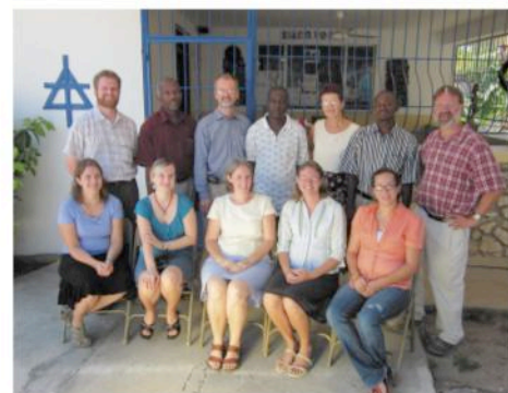
Sous Espwa Team, April 2011